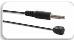
Alternate IR Emitter Cable CIR-EMT2 (The CIR-EMT2 has a mono-type plug) Pinout: Tip=Anode, Sleeve=Cathode

An alternative emitter cable is CIR-EMT2 . This cable is best suited for situations where there is a need to isolate and confine the IR signal to just one device. This is useful in cases where there are several devices that respond to the same IR signal and you want to control only one particular one. A separately sold adhesive rubber cover ( CIR-EMT2-CVR ) can be used to confine the IR beam to just one target device.