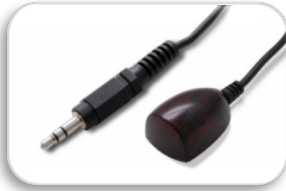
IR Detector Cable CIR-DET-P2 (Detector eye has adhesive backing) Pinout: Tip=Data, Ring=+5V DC, Sleeve=GND

The UHBX devices use “pass-thru” IR detector cable that maintains the IR modulation. Compatible cables are available from Hall Research (Model Number CIR-DET-P2 ).