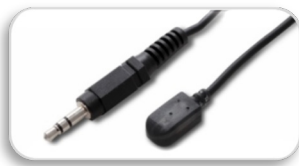
IR Emitter Cable CIR-EMT (Emitter has adhesive backing) Pinout: Tip=Anode, Ring=Cathode, Sleeve=Not Connected

CIR-EMT , shown below, is recommended for most applications