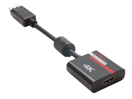
Model GC-DP-HD: DisplayPort source to HDMI output

To connect to a source (PC) with Displayport output, use GC-DP-HD.