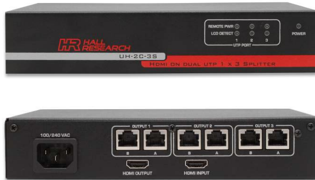
Figure 2 – Front and Rear Panels