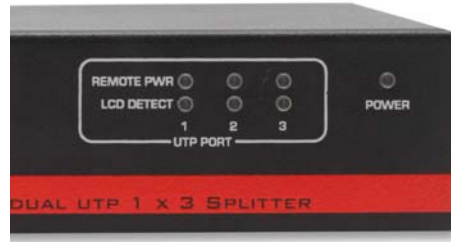
Figure 3 – Front Panel Indicators

In addition to the power indicator LED, this unit is equipped with (6) LED's that show the status of the remote receivers on UTP ports. These indicators are a great tool for helping ascertain possible reasons if a remote display is not working.