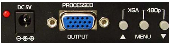
Figure 4 - Output