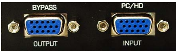
Figure 3 – Input