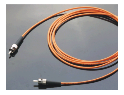
4.0 HR-101-R Description

OM2 Cables: CST-OM2-length (length = 100, 300, or 500 meters) OM3 Cables: CST-OM3-length (length = 700, 900, or 1,000 meters)