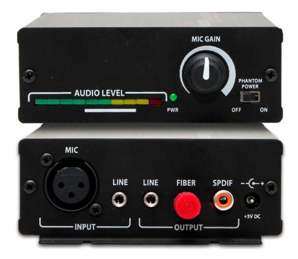
HR-101-S Front and Rear views

The HR-101 can extend an audio over a single multi-mode fiber optic cable spanning distances of over 1000m (3280ft). For lengths of upto 500